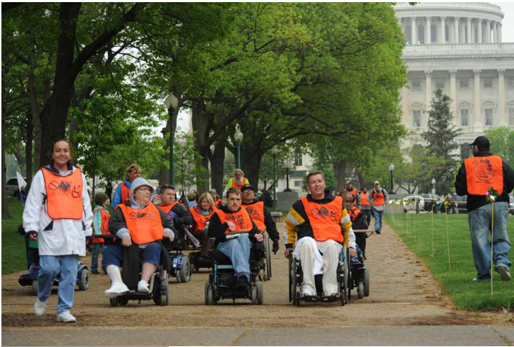
ADAPT Fun Run Washington, DC